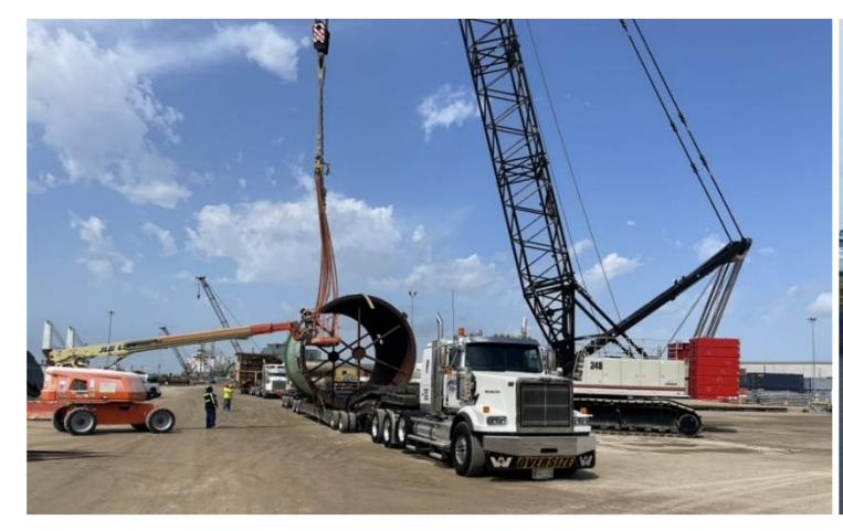
Figure 3. Second shipment of equipment loading to the cargo ship in Guatemala